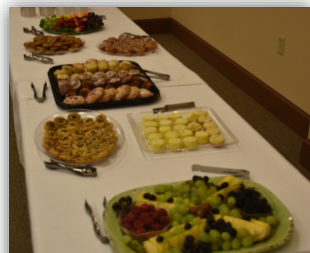
Seeking coffee host/hostesses for June and July! Sign-up on the Bulletin Board.