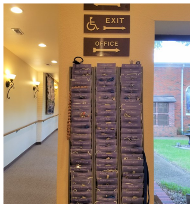
Main nametag racks in place

Two new nametag racks have been installed! The rack pictured at left holds the majority of attendees. It has been placed on the column aside the ascending hallway to the church near the Courtyard. The main nametag rack allows for easy access for those entering from the double red doors and from the office door. A second rack has been placed adjacent to the closet on the Hall Street side. This second rack is accessible to those entering from the Hall Street parking area.