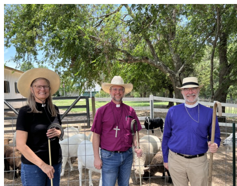
Our three shepherds!

Not sure how to become a member or what is going on? This potluck will provide some information for new to St. Dunstan attendees. Plan to attend the Potluck!