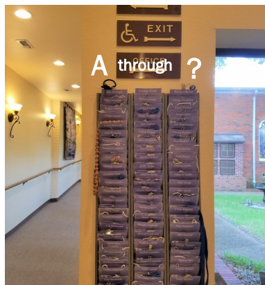
Main nametag racks in place

Two new nametag racks are on their way! The additional racks will join the rack installed on the Hall Street side of the Nave. Parishioner names will be placed alphabetically. Signage will indicate "A" through "???" in the racks near the main entryway. Any name beginning after the second posted letter (currently shown as a "?" in the photo at left) will be placed in the Hall Street racks.